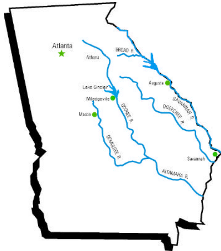
Figure 1. State of Georgia showing the location of GPC's Sinclair Hydroelectric Project and major rivers within the Georgia portion of the historic range for the robust redhorse.

During the early stages of FERC relicensing in 1991, a rare fish was "rediscovered" in the Oconee River downstream of the Sinclair Project. The fish was eventually identified as the robust redhorse Moxostoma robustum by several ichthyologists.